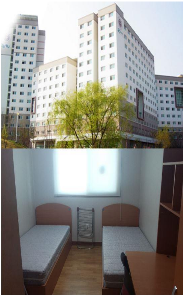
Building 6-9 (interior, exterior)