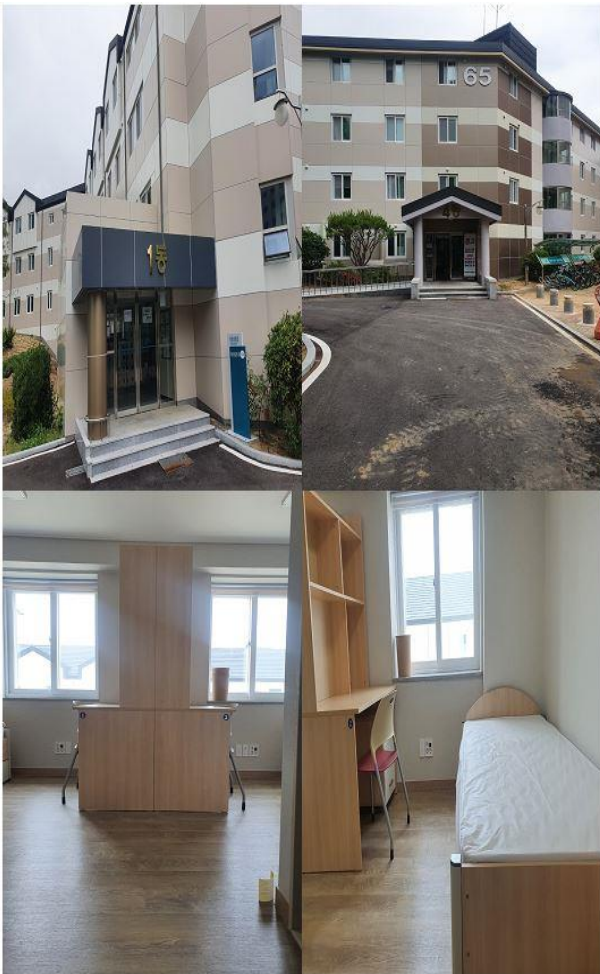
Building 1-4 (interior, exterior)