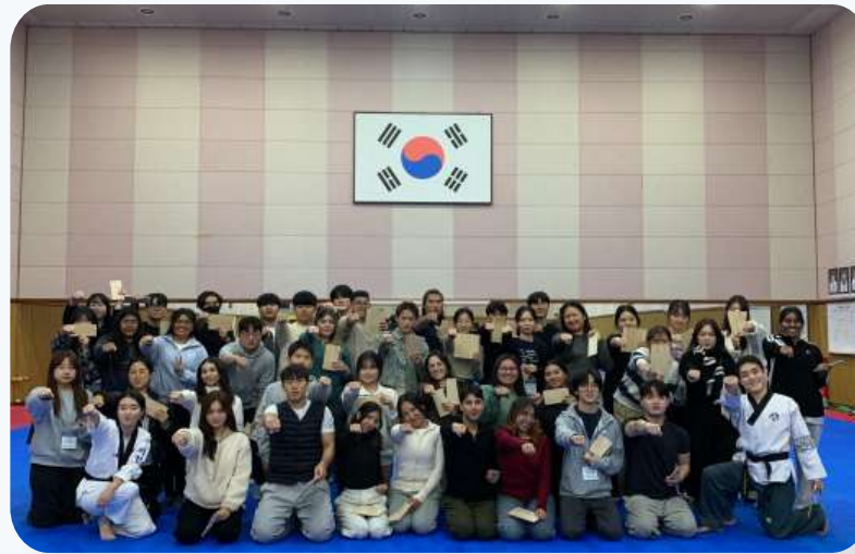
Taekwondo Basic Form