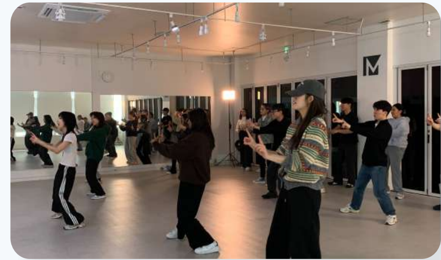
K-Pop Dance class