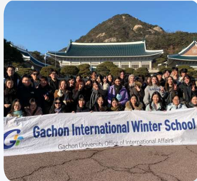
The Blue House