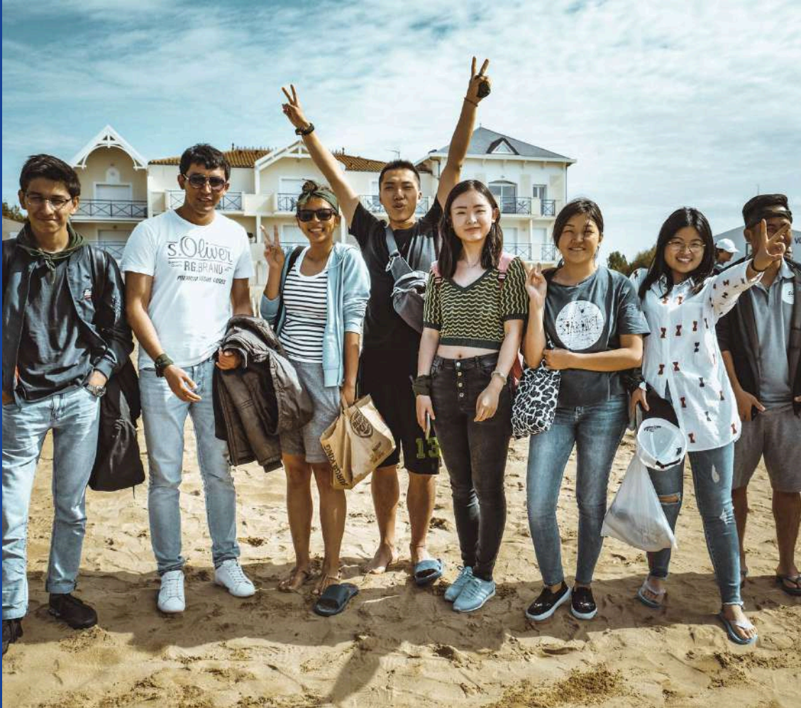
Design: Excelia All rights reserved - 03/2024 - This document is non-contractual. The Management reserves the right to modify content and dates.