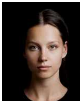
Dark background color makes it difficult to determine outline