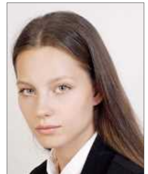
Body is angled