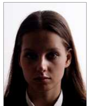
Shadow on face