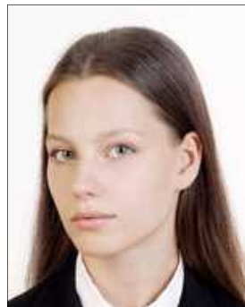
Face is angled to the side