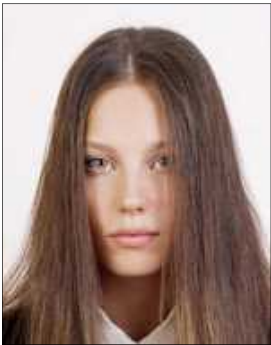
Eyes are obscured by hair