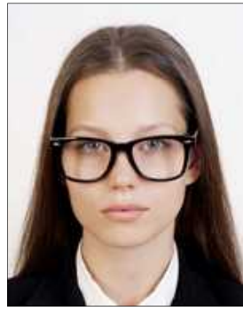
Glasses frame is exceedingly large