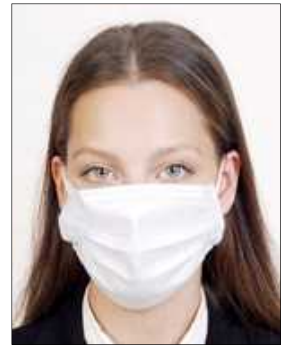
Part of face is covered with a mask