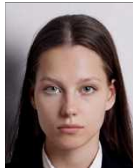
Shadow in background