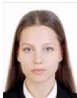
Not clear due to focus issue or vibration of camera