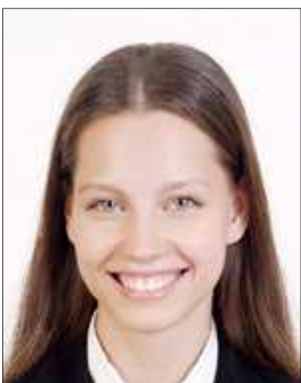
Expression differs greatly from normal expression