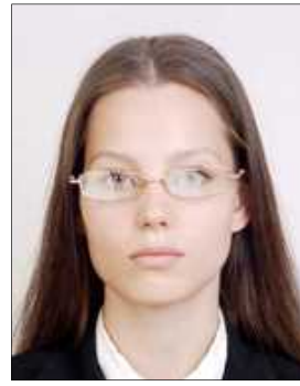
Lighting is reflected in glasses