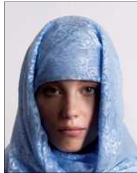
Cloth wrapping creates a shadow on face (Note) Head wrappings made of cloth, etc. are acceptable if the face is clearly visible.