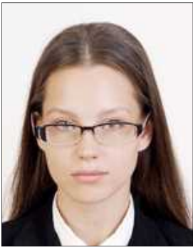
Glasses frame covers eyes