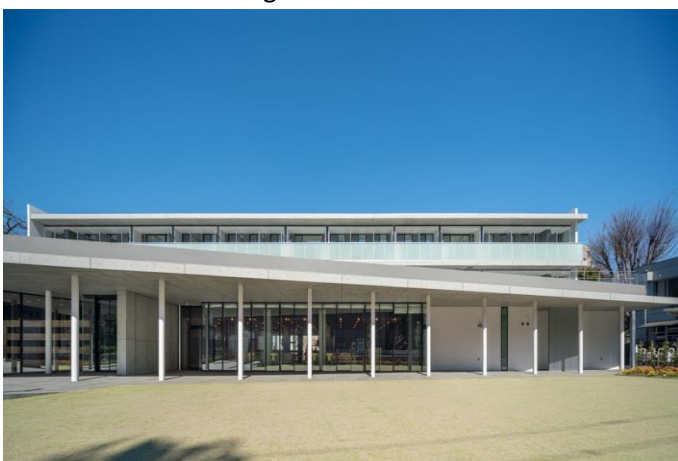
Exterior of the building 外観