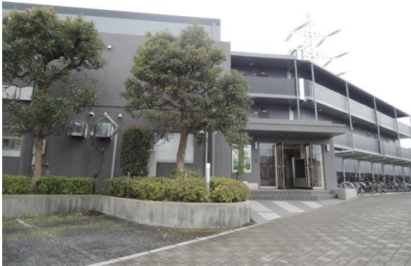
Exterior of the building 外観