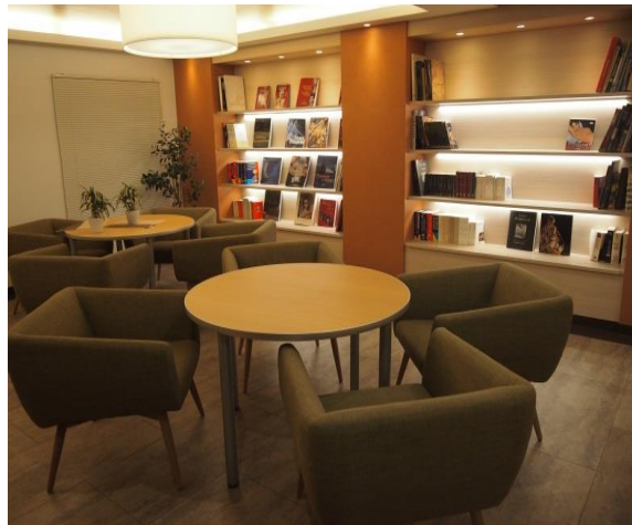
Entrance Lobby エントランスロビー