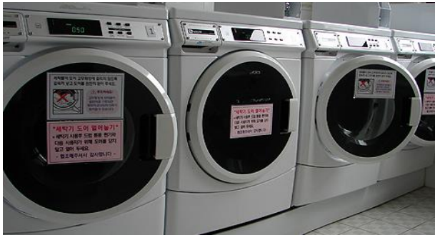
< Laundry Room >