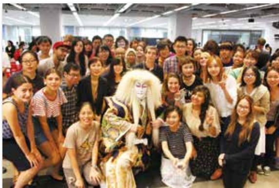
Kabuki Workshop 歌舞伎ワークショップ