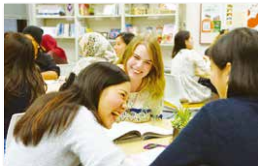
Open Lounge オープンラウンジ