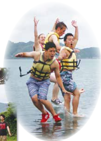
MIX camp ミックスキャンプ