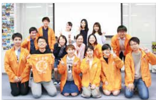
SIED Kyotanabe Campus / 京田辺キャンパス

SIED (Student Staff for Intercultural Events at Doshisha)