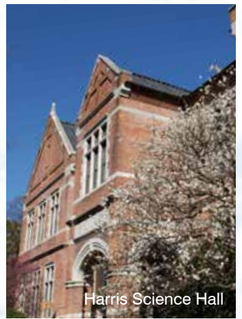
Harris Science Hall