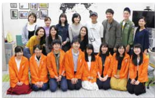
SIED Imadegawa Campus / 今出川キャンパス