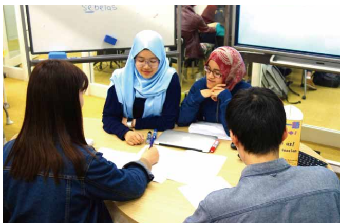
Mi-Room (Multilingual Immersion Room)

http://www.kansai-u.ac.jp/Kokusai/short_term/