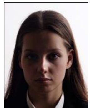
Shadow on face