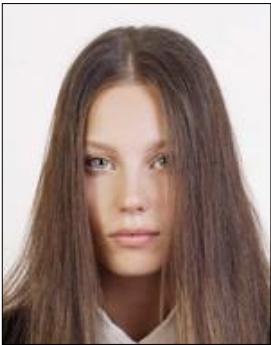
Eyes are obscured by hair