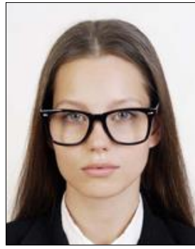
Glasses frame is exceedingly large