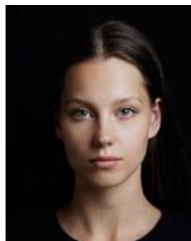
Dark background color makes it difficult to determine outline