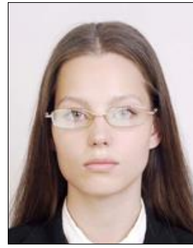
Lighting is reflected in glasses