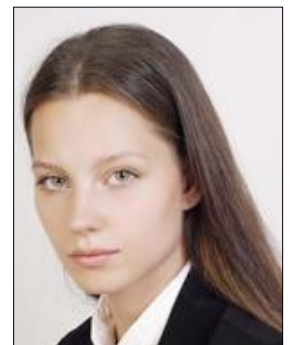
Body is angled