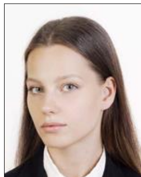
Face is angled to the side