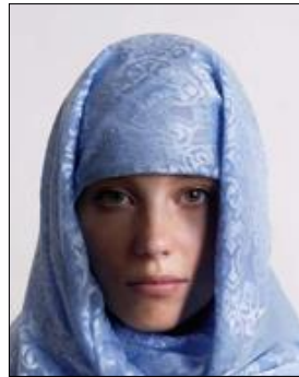
Cloth wrapping creates a shadow on face (Note) Head wrappings made of cloth, etc. are acceptable if the face is clearly visible.