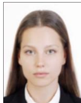
Not clear due to focus issue or vibration of camera