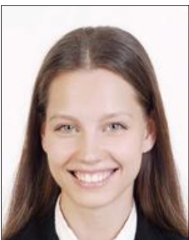
Expression differs greatly from normal expression