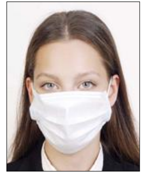
Part of face is covered with a mask