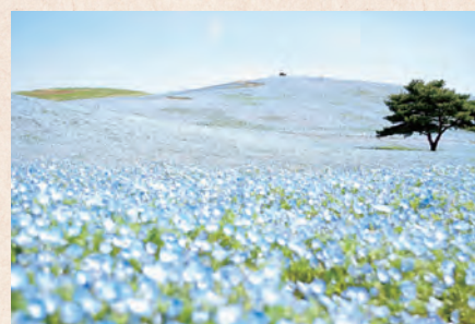
Hitachi Seaside Park