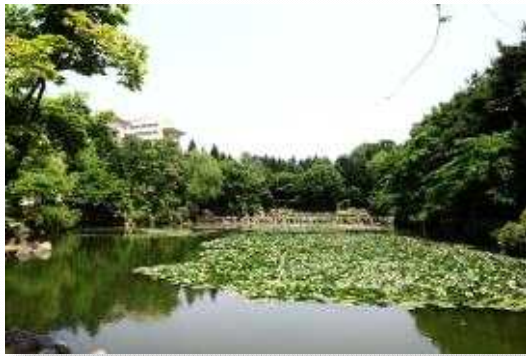
Taeback-Gwan (Shinhan Bank and International Affairs)